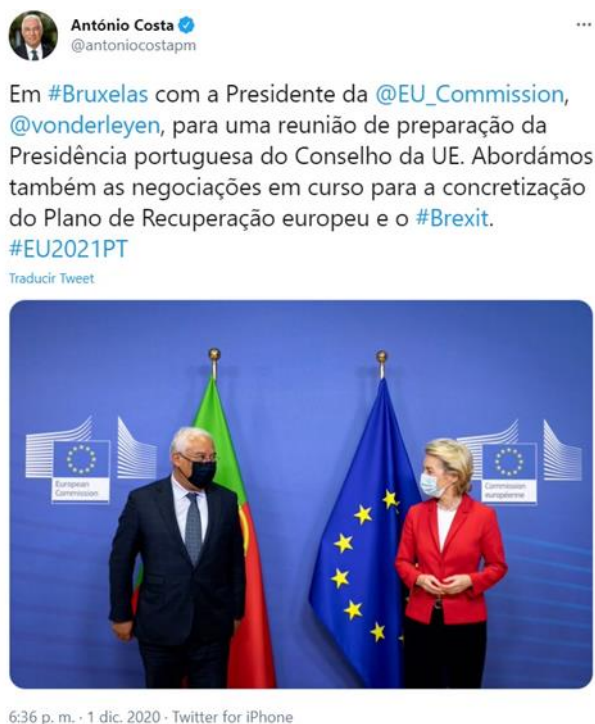
Image 2: Tweet by António Costa regarding a European meeting for the Recovery Plan

For his part, Boris Johnson's use of Twitter can be interpreted as emotional and personal, full of qualifying adjectives. In this sense, terms such as "unforgettable", "unprecedented", "brilliant", or "fantastic" are common. He does not use hashtags and mentions regularly, but is limited to specific moments such as international summits (#G20) or open question and answer sessions to the prime minister (#PeoplesPMQs), as well as to figures who at some point capture the attention, such as international leaders (@narendramodi) or pharmaceutical companies (@Pfizer, @AstraZeneca). The messages on the harshest issues of the virus are not accompanied by these expressive modalities, presenting only text. In fact, this is repeated in the GOV.UK portal. The updates about Covid-19 are exposed in schematic pieces, which distribute the data in points with a sober and simple style, evidencing an informative purpose.