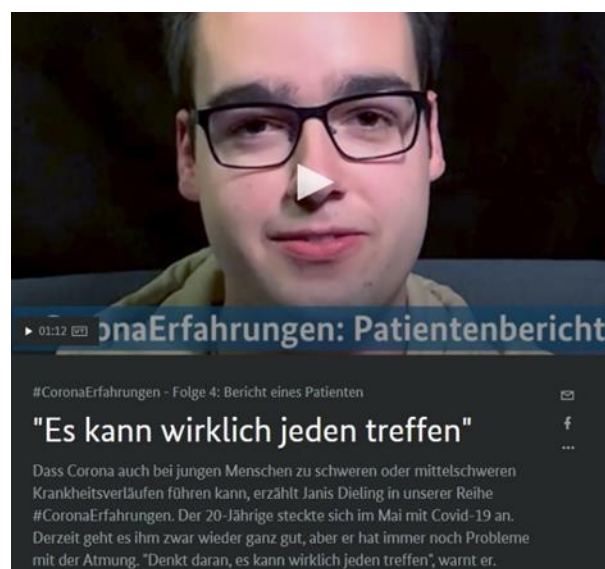
Image 5: German federal government web post about a personal experience with the virus.

The variables that offer the greatest singularities are attributed to technical profiles (experts) and citizens. The experts appear in Bundesregierung (13.3%), and at a lower level in La Moncloa (6.4%). As for citizens as an informative source, they are only referenced on the German portal (13.3%). Image 5 exemplifies their use for social awareness purposes, citing the personal experience of a young man who overcame Covid-19.