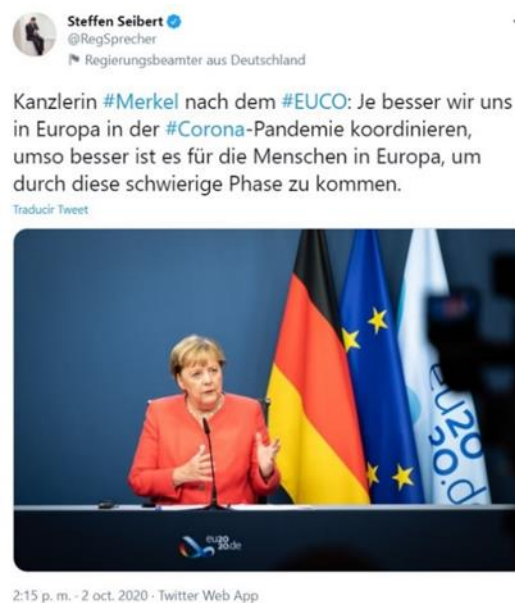
Image 4: Tweet by Steffen Seibert providing statements by Merkel after a European Council.

Likewise, the high level of interaction of the category "others" (52% have over 300 retweets), linked to events such as the celebration of world days or anniversaries, is remarkable, since this has been the category that has contained all those topics. These are positive issues that involve a cascade of reactions, moving away from more political purposes. On the other hand, there is little interest in references to the EU, to the point that they represent the target with the most retweets in the lower echelon (56.75%). These messages about the Union refer to meetings such as those of the European Council (image 4), in which coordinated measures are drawn up for the management of the pandemic.