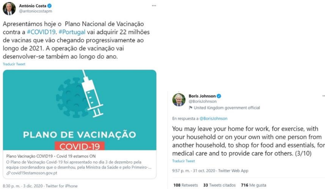
Image 3: Tweets by António Costa and Boris Johnson about legislative measures (objective) of sanitary actions (topic): vaccination plan and confinement regulations.