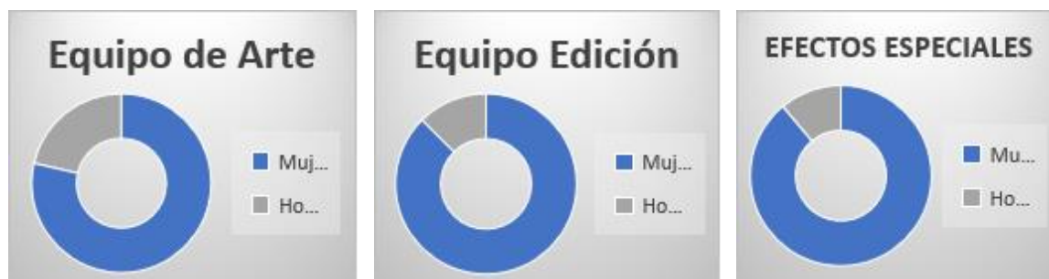
Graph 4

The teams that present a complete gender gap are the Cinematography teams; photo team, and Music and Sound, since they have an absolute majority of men, there is no woman in any of the aforementioned teams. Women are slightly starting to appear in the photography and sound section, shyly, both fields have traditionally always been in male hands.