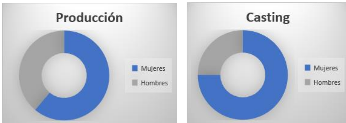
Graph 1

When carrying out an analysis of work teams, the results are totally unequal in some of the sectors.