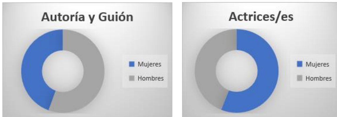
Graph 3

In the Authorship and Screenplay section, with 56% male presence compared to 44% female, the prevalence is male with a very slightly higher percentage, 12%. These results contrast relatively with those obtained by Smith in her study, in which the general presence of women in this section was only 13.2%, which implies a slight oscillation of 1.2%.