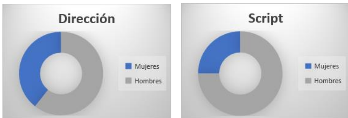
Graph 2

The Production team presents a percentage majority of women over men, standing out at 22%. In the Casting team, the predominance of women presents a difference of 50% over men. Women have a predominant role, therefore, in both Production and Casting teams (61% and 75%, respectively). Production teams have traditionally been in male hands, so these results offer a striking contrast to the results of Smith's study, in which only 20.7% were women in these teams.