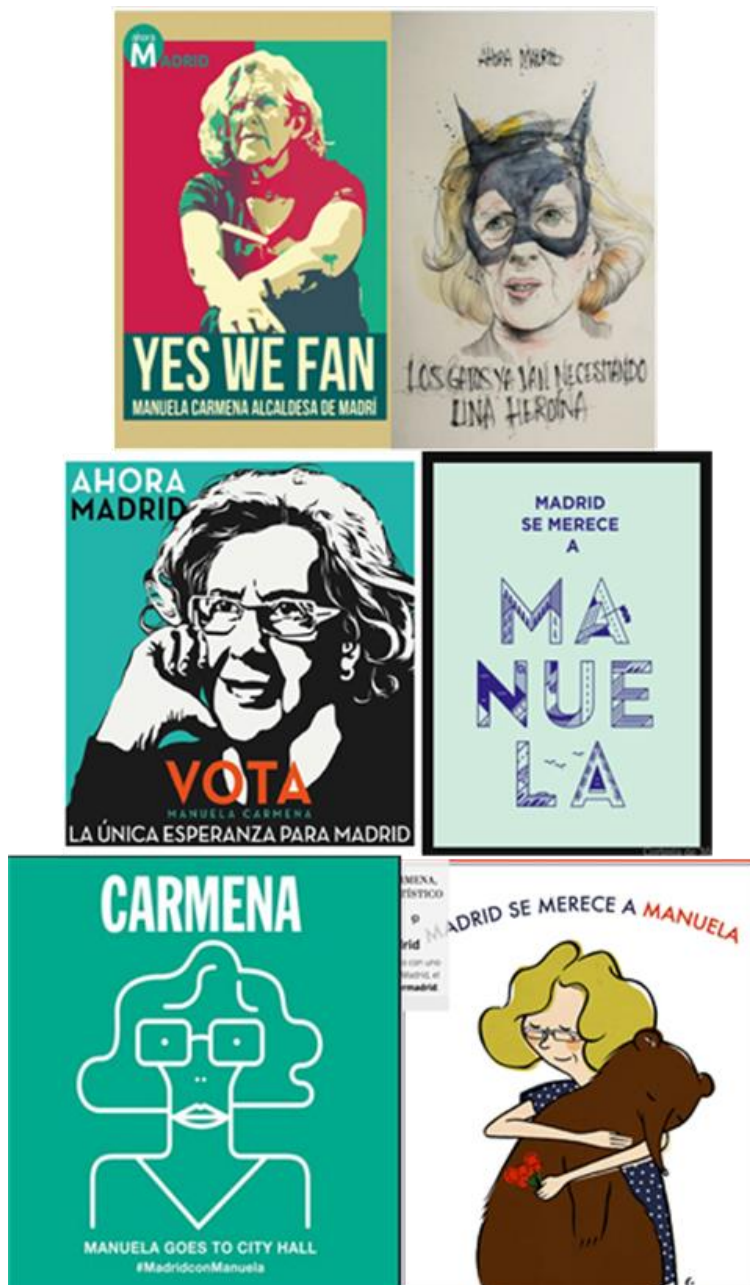
Figure 2. Graphics used during the citizen campaign

a practically unknown party for majorities, and coming from a citizen movement (the 15M), obtained unexpected results positioning in the European Parliament. The intelligent management of social networks and online channels had a lot to do with this surprising result. As was also observed in the focus of this study.