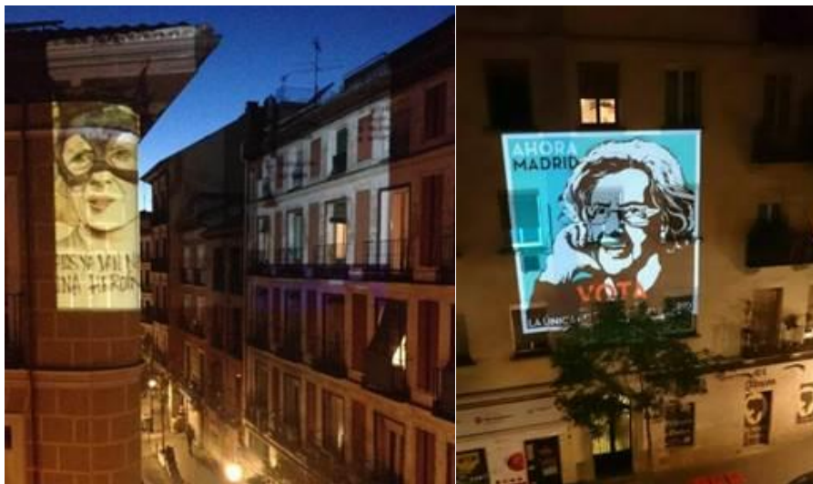
Figure 4. Guerrilla Marketing actions in outdoor media

And with these data the following questions arises: how is it possible that with these scarce resources there could be a campaign against very well positioned and potent rivals such as PP and PSOE?”. The answer is conclusive, only by using tools as potent and innovative in the political dispute such as Artivism and Grassroot , we mentioned earlier in this study.