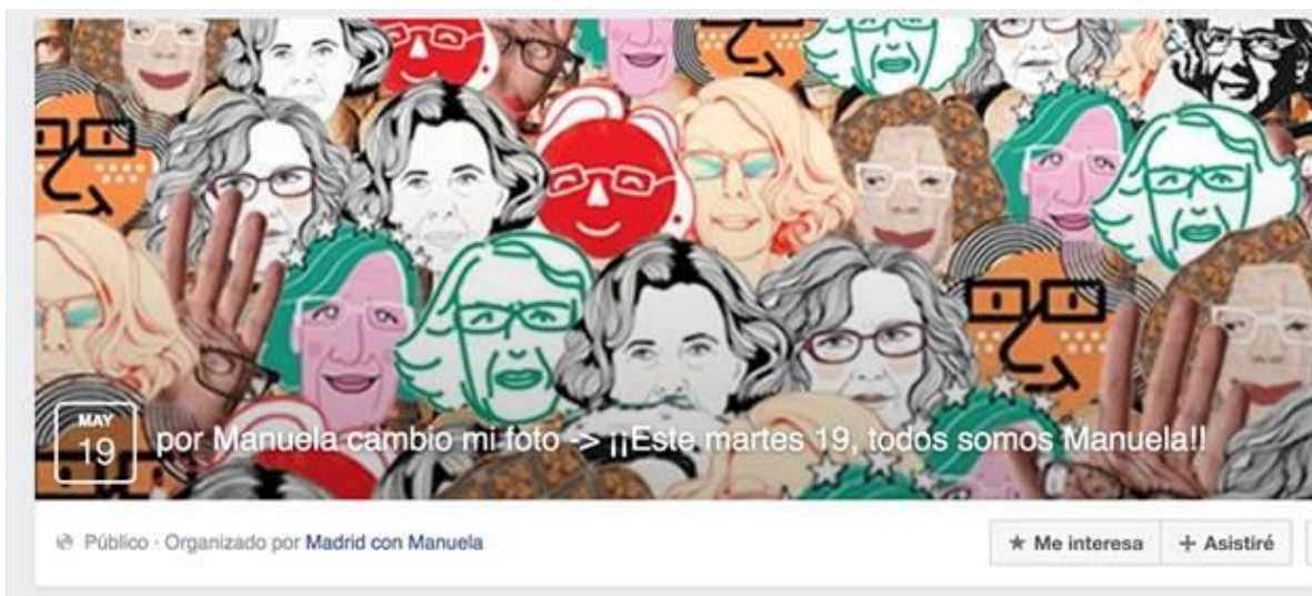
Figure 3. Action in Facebook on 19 May 2015

In this sense, and like this paper, Dader, Cheng, Campos, Quintana and Vizcaíno-Laorga (2014) state that the analysis of the websites of political parties in campaign constitutes the witness of the evolution of communication strategies not only from the party, but it also represents a contribution to a general level within the study of the political communication.