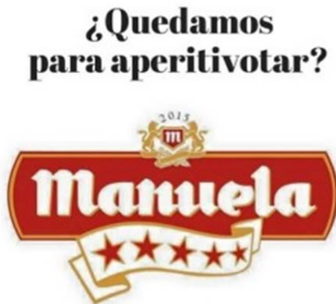
Figure 6. Example of meme used in the citizen campaign

It can be said that the leading role of this campaign was left in the hands of the people from Madrid, that its copywriters and authors were the neighbours and that its communication channels, were the walls of every corner of the city’s neighbourhoods. An outdoor advertising that jumped out of conventional platforms to flood the complete Town and Court with the interpreted and the re-interpreted figure of Manuela Carmena.