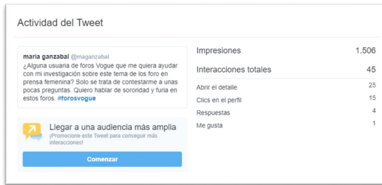
Figure 2: Twitter activity, impressions and interactions.

The collaborations came very soon and in one week the number of female and male forum users that participated in this research were of 47 (with one moderator of one of the threads included).