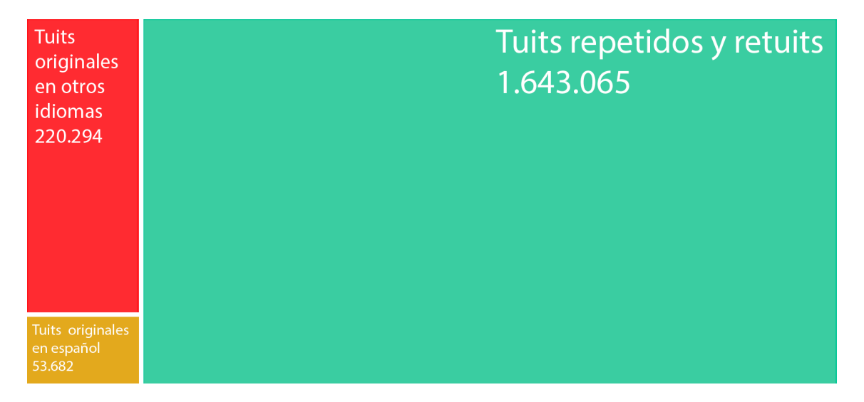
Figure 1: number of repeated and original tweets in Spanish and other languages.

Subsequently, we created two functions aimed at identifying the tweets related to the sports drink brand "Aquarius", to the astrological sign and the constellation of the same name. The functioning of both functions was based on the contextualization of the Aquarius term, identifying those words sequences related to each one of these areas of meaning.