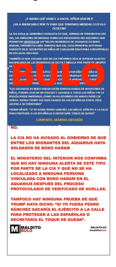
Figure 3: Meme and refutation of the hoax that went viral with the message: "The C.I.A. has warned the Government that among the Aquarius migrants there are Boko Haram soldiers"

Together with the tweet there was this image: