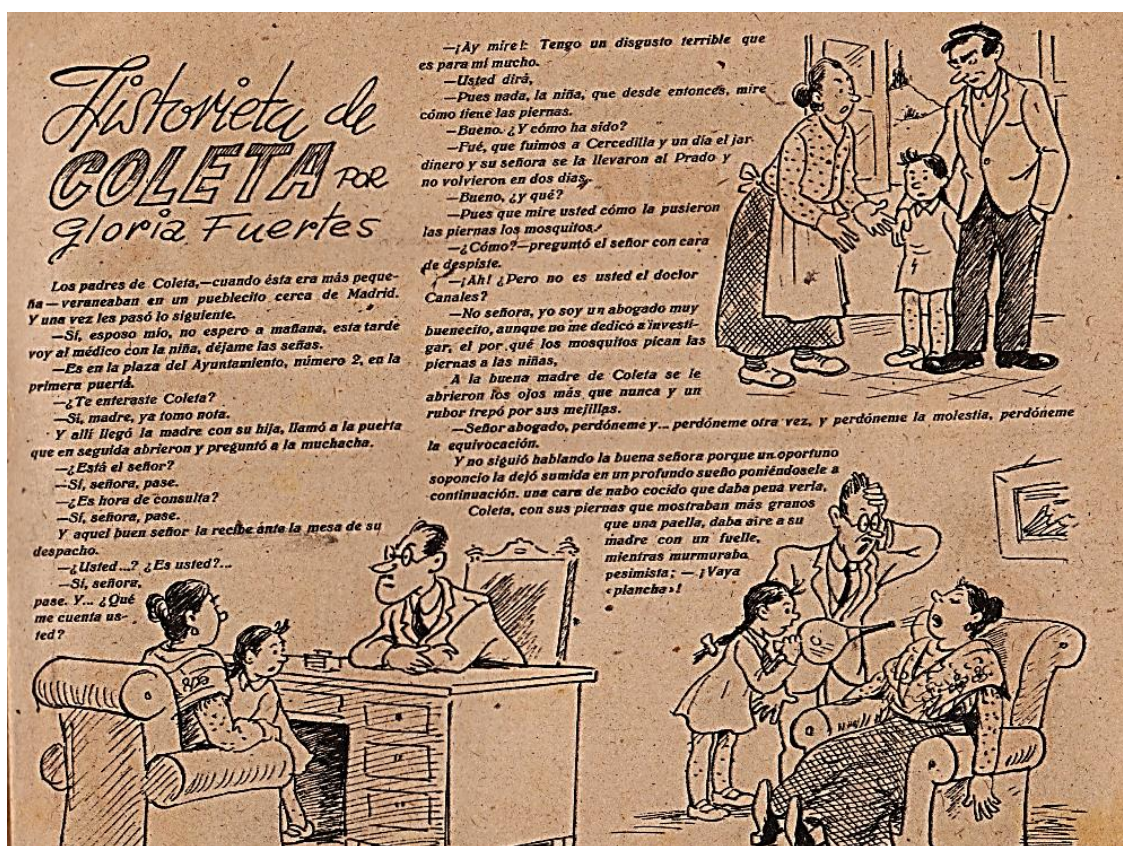
Figure 1. "Historia de Coleta" by Gloria Fuertes and illustrations by Soravilla. Maravillas , nº 800, 7 June 1945, p. 5.

and 1945, date when the Falangist monopoly about the children's press ended, at the same time the platforms of the unique party acquired a different orientation on the occasion of the events happening in the international sphere after the decline of the II World War.