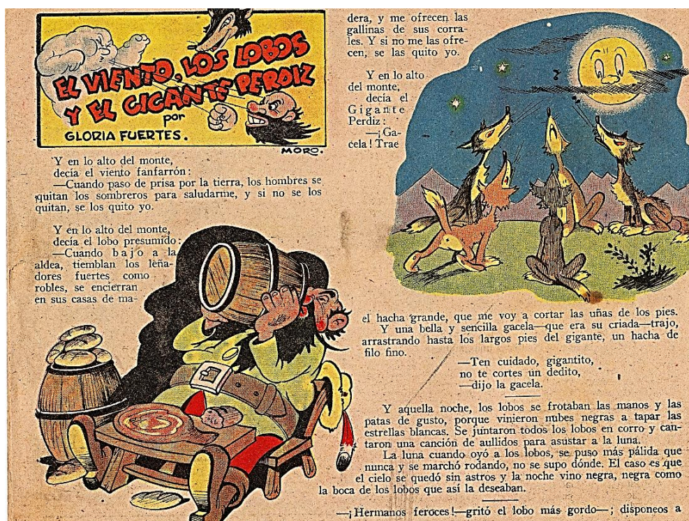
Figure 4. “ El viento, los lobos y el gigante perdiz ” by Gloria Fuertes with illustrations by Moro. Maravillas , nº 297, 17 May 1945, p. 1.

interdisciplinary prism, the writer from Madrid also collaborated with other outstanding artists of the time, especially with Moro, who illustrated stories like “ El viento, los lobos y el gigante perdiz ” (The Wind, the wolves and the Partridge) published on 1945 (Figure 4).