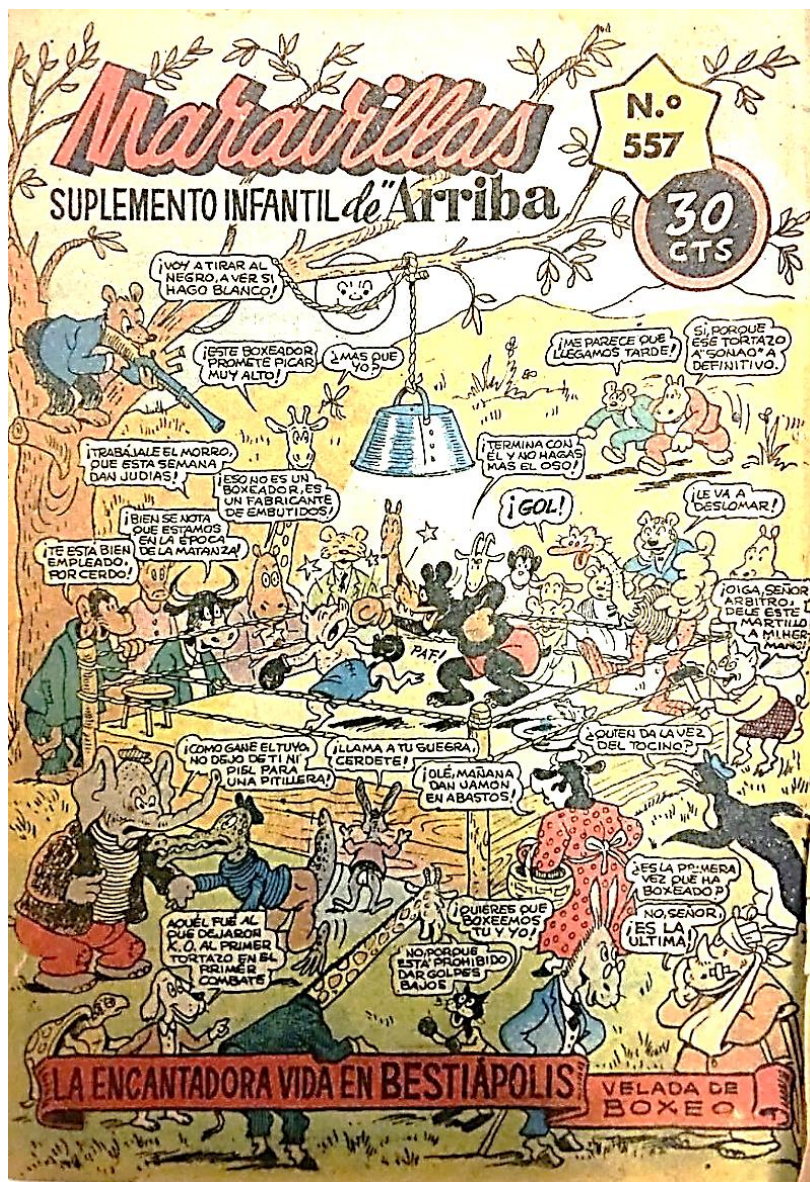
Figure 3. Cover of Maravillas as Supplement of Arriba , third period, n° 557, January 1951, p. 1.