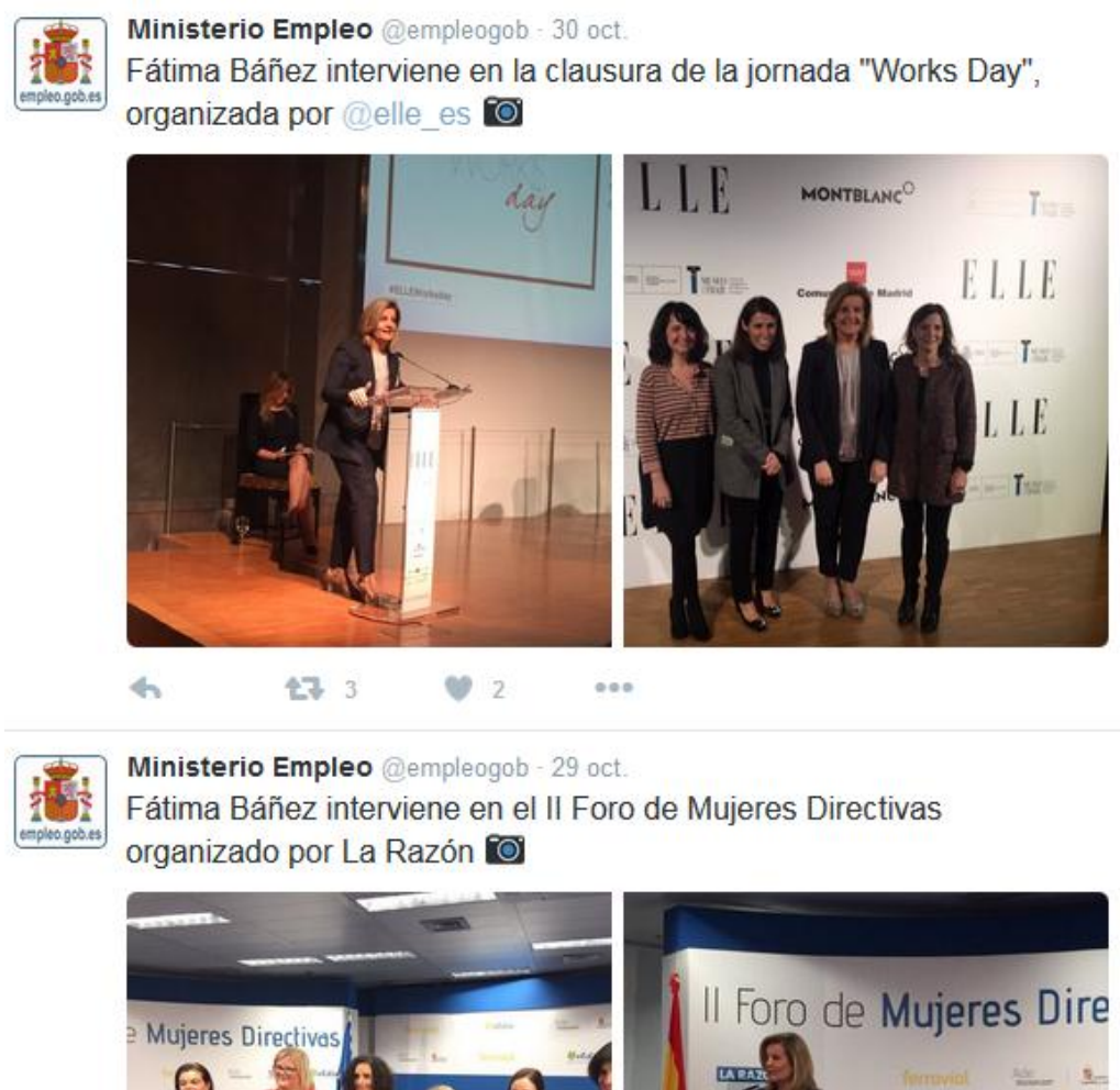
Figure 9. Tweets with presentist and out-of-context images of the Minister.