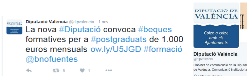
Figure 6. The “new” Provincial Council of Valencia