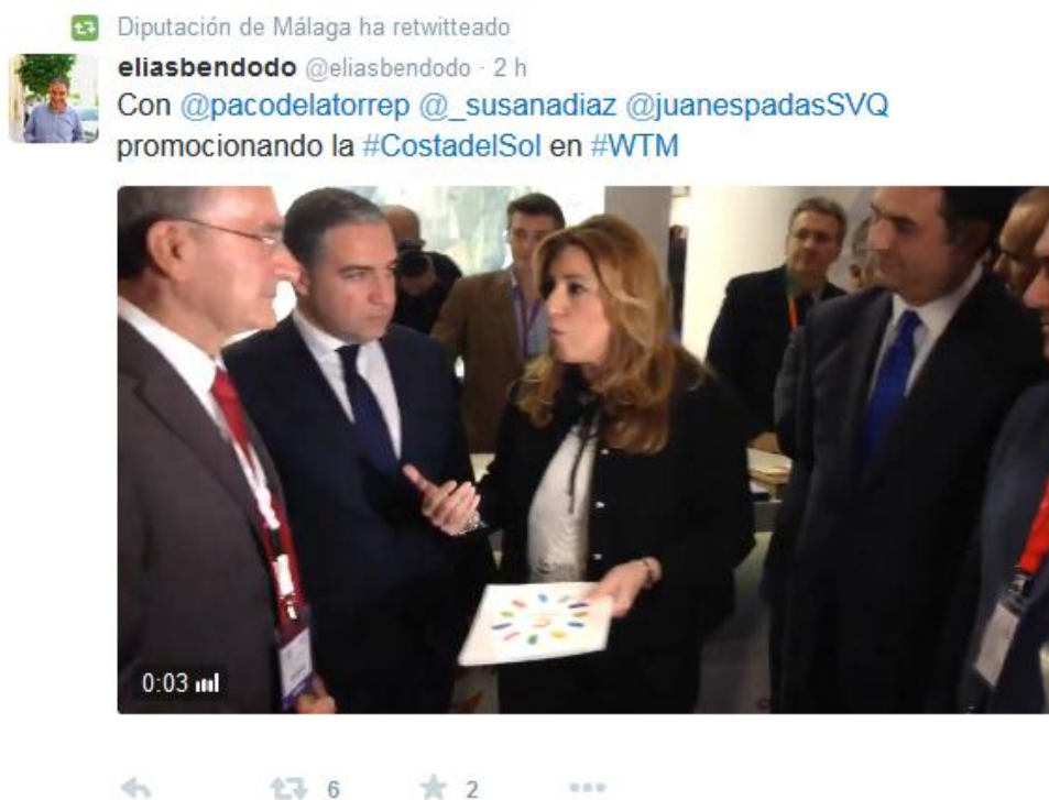
Figure 8. Retweet by the Provincial Council of Málaga of one of its president's tweets.