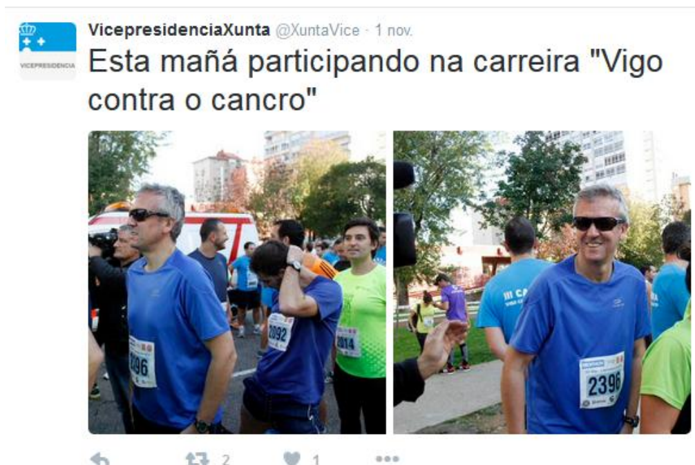
Figure 2. Political Framing in the account of the Vice-presidency of the Government of Galicia.