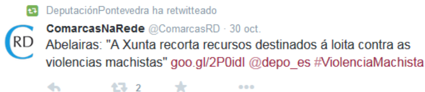
Figure 3. Use of the institutional Twitter account to protest against the action of an administration controlled by other party.