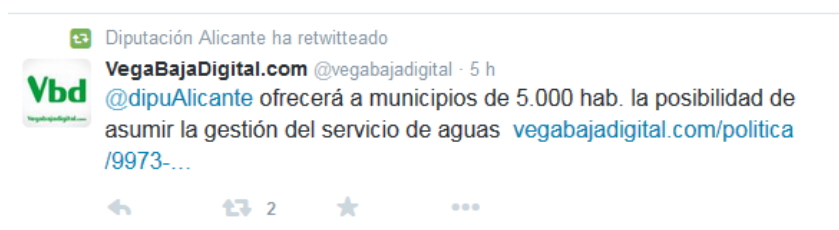
Figure 10. Political tweets related to other administrations and not to the citizens.