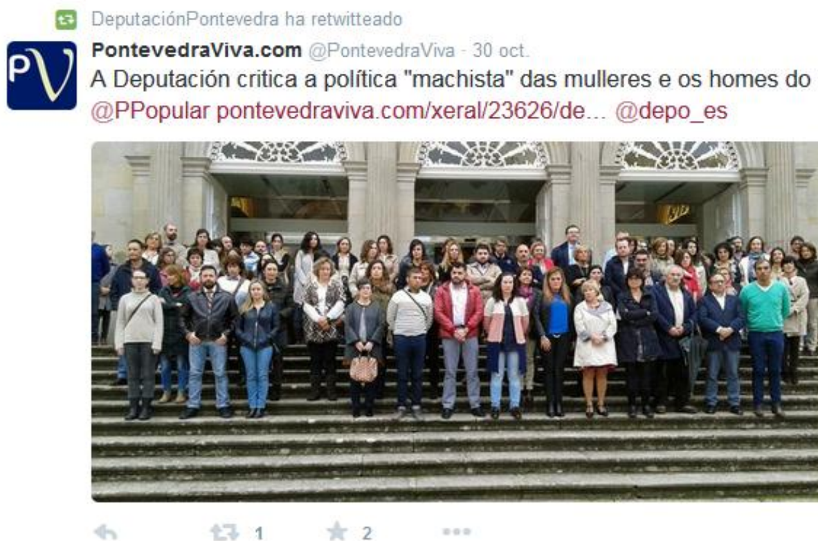
Figure 4. Use of a Twitter institutional account to criticize the main opposition party.

Source: @depo_es (screenshot taken on the 11/02/15)