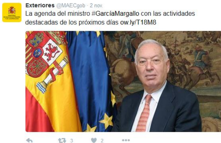
Figure 7. Overrepresentation of the institutional agenda